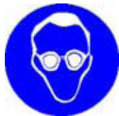
Tightly sealed goggles